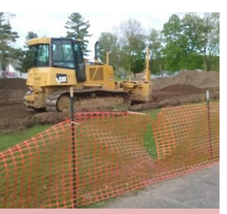
The bulldozer moved earth.....