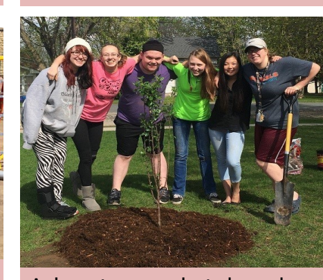
A cherry tree was planted....and