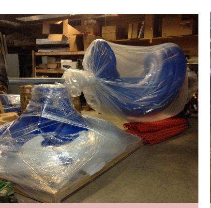
New equipment filled the garage!!