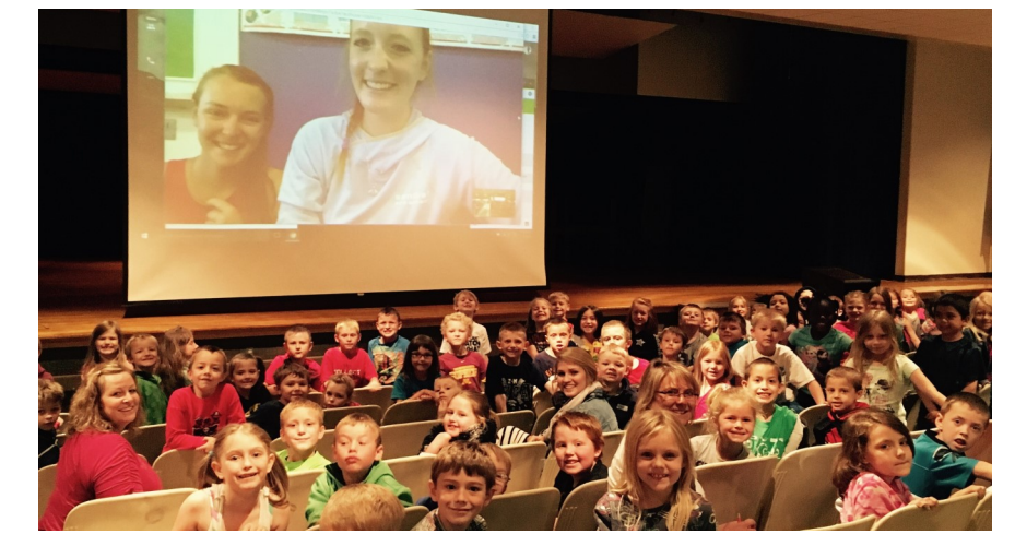
First graders video chatted with a Marine Educator in Florida! It was awesome and the first graders learned a lot about the marine world.

There were no future agenda items and the meeting was adjourned at 8:11 p.m.