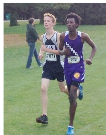
ZM runners participated in a home cross country meet