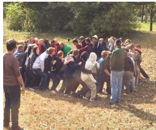
9th Graders attended a retreat