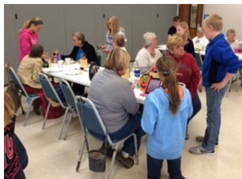
Sixth graders showed Mazeppa Senior Citizens how their iPads worked and Kindergarten went to Mack's Pumpkin Farm.