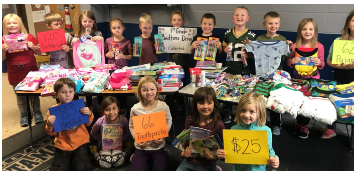
Gr 1 donates pjs, books, toothbrushes, and money!!