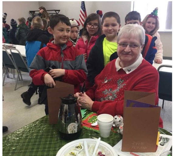
Gr 3 sharing with Mazeppa Senior Citizens

Students in the 4 th grade collected and bought hats, mittens and scarves for the mitten tree. Donations were shared with the food shelves in both communities.