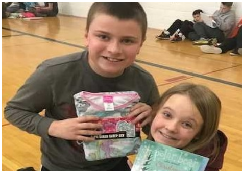
Gr 5 donated pjs and books for those less fortunate

FFA students ran their annual fruit sales for charity. Dollars raised were used to purchase items for those less fortunate in our communities. Students bought over $2,000 of gifts for distribution! Thanks to everyone who purchased during this fund