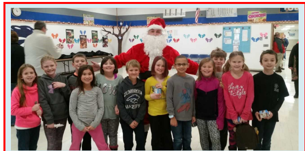
Santa made a surprise visit to the elementary school during the annual holiday meal December 14!