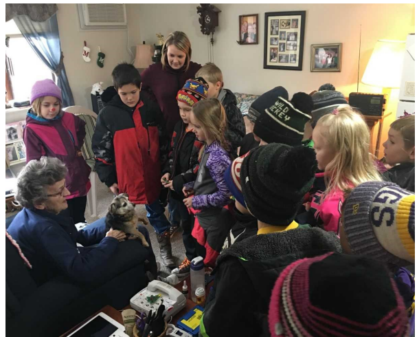
Gr 2 visits Zumbrota Health Services