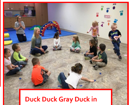
Duck Duck Gray Duck in preschool