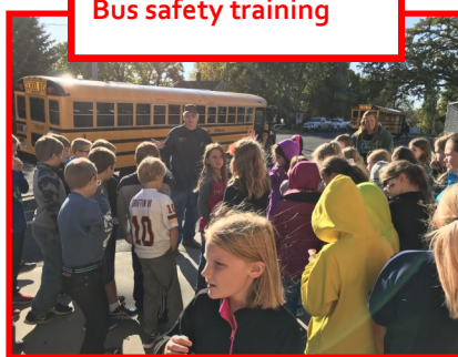
Bus safety training