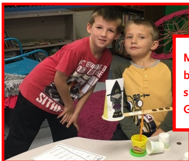
Making a balance scale in Grade 2