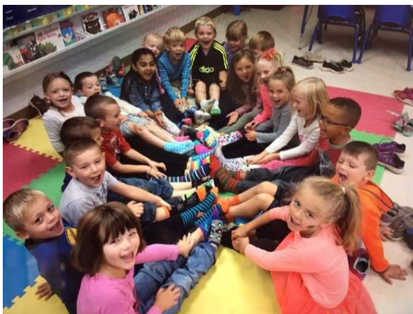
Silly sock day in Kindergarten