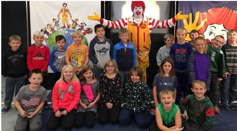
Ronald McDonald visits the primary school, teaching respect

Using erasable sticker pads for learning