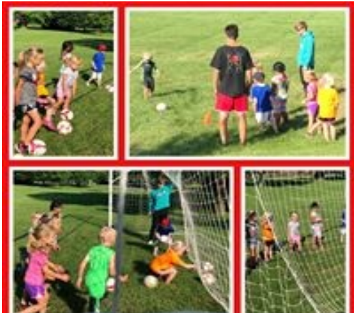
Soccer and more soccer