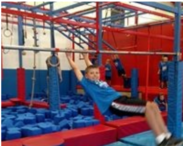
Exciting field trips in Community Ed