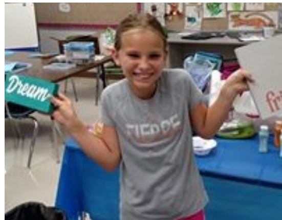
Great Community Ed classes!!