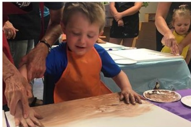
Painting like Picasso