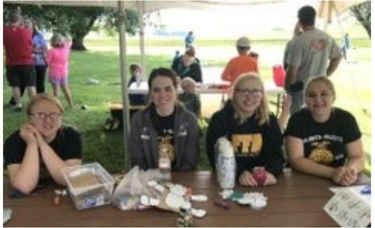
FFA members are helping at Goodhue County Breakfast on the Farm- making cow puppets and planting seeds with kids!