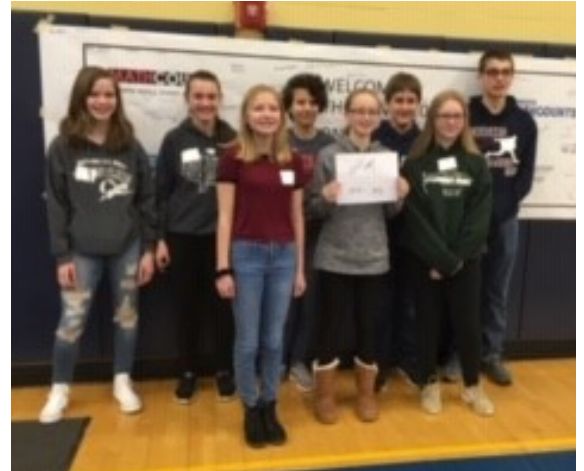
Members of the middle school math league