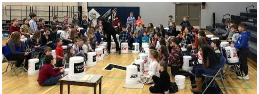
Gr 4 put on a great concert February 26—making music on pail drums

The group is free, open to public, and 100% confidential. For information, call Joel at 507-206-8557. To reach the NAMI offices, call 1-888-626-4435 or visit their website at www.namimn.org .