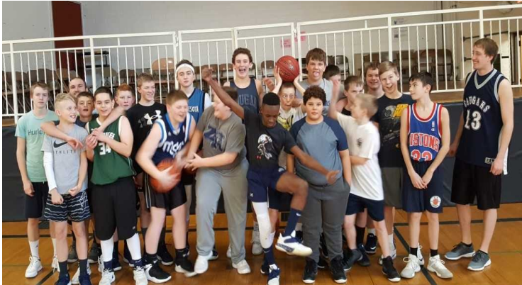
Wear what you want day during the last practice of 7/8 boys basketball season!!