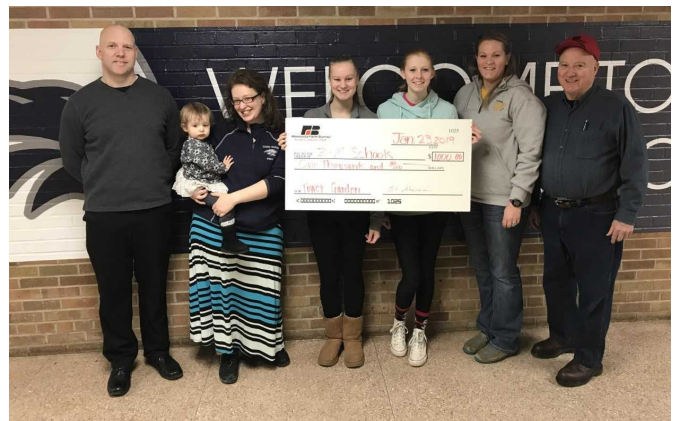
Thanks to Farm Bureau for donating $1000 to FCCLA for a tower garden.