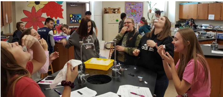
Making and tasting ice cream in high school science