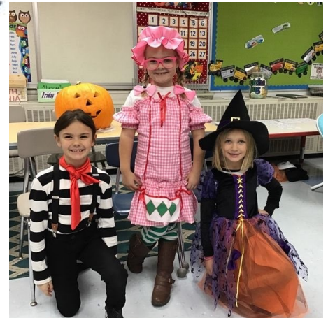
Halloween fun in the Primary