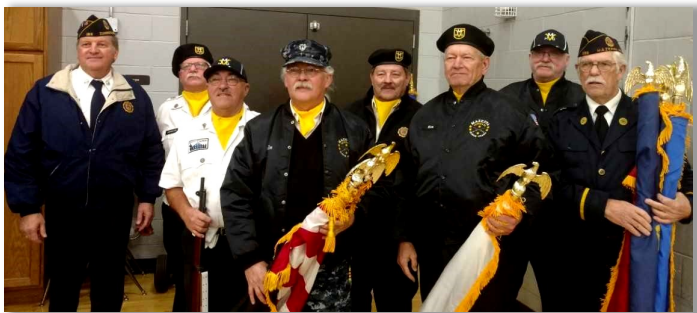
Thanks to the veterans who gave of their time for our students