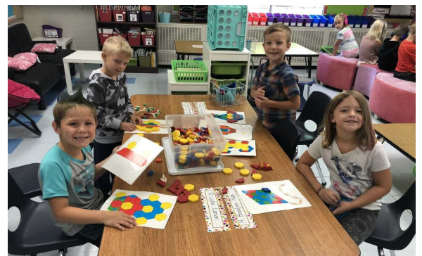
Grade 2 math