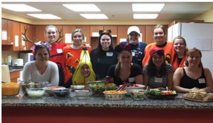
National Honor Society served a meal at the Ronald McDonald House on Halloween