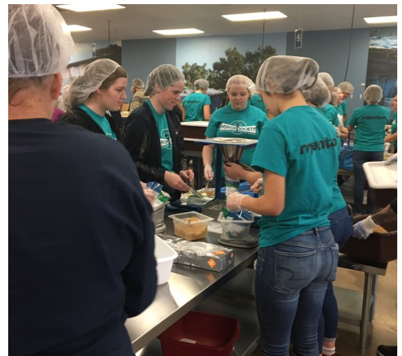
NHS students also made meals at Feed My Starving Children