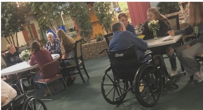
Students in high school language arts interviewed Zumbrota Health Care residents on their life experiences. A great way to bridge the generations.