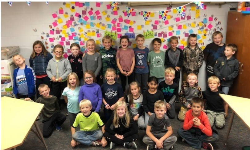
Wall of Kindness in the primary social skills class. The K-2 students wrote down different ways to be kind and shared ideas with one another and other classes.