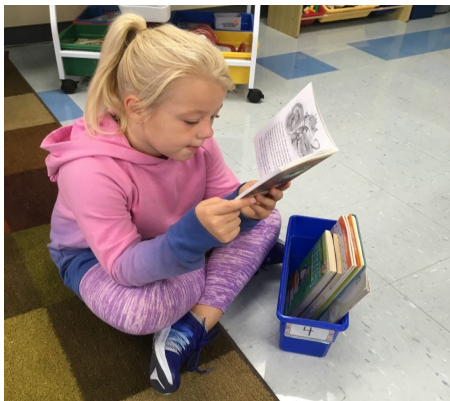
What is better than a good book?

A HUGE thank you to Prigge's Flooring for donating many carpet squares to the primary music classes—makes sitting on the floor so much more comfortable!