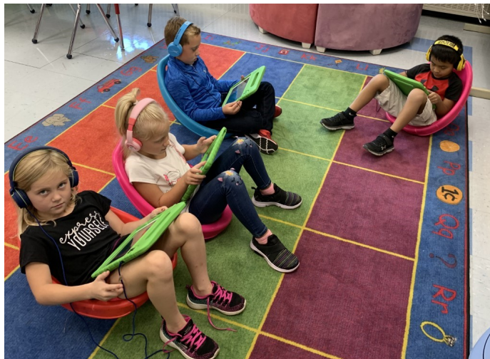
Doing monkey math with an iPad app