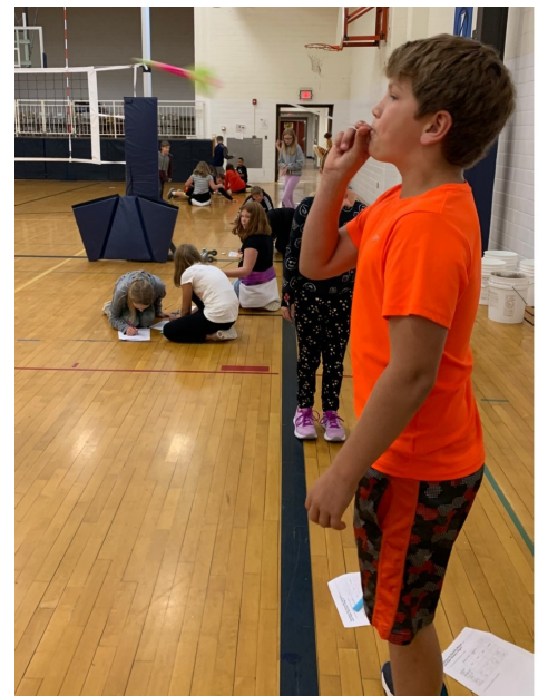
Right: 5 th graders are practicing being scientists by generating scientific questions about what makes the best paper rocket and then testing their hypothesis with an experiment!