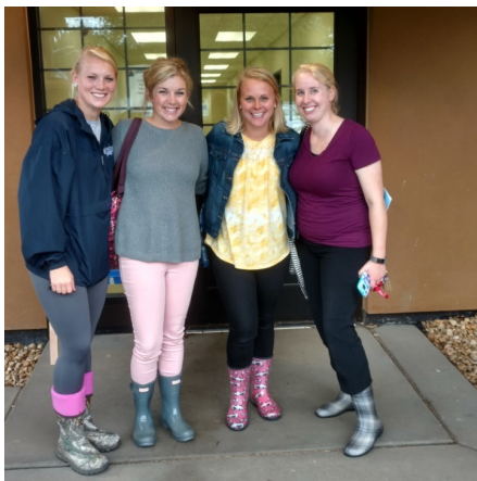
Left: Our preschool teachers put on their boots and helped clean up during the recent flooding in the preschool building.