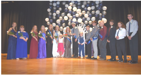
Homecoming Royalty Court