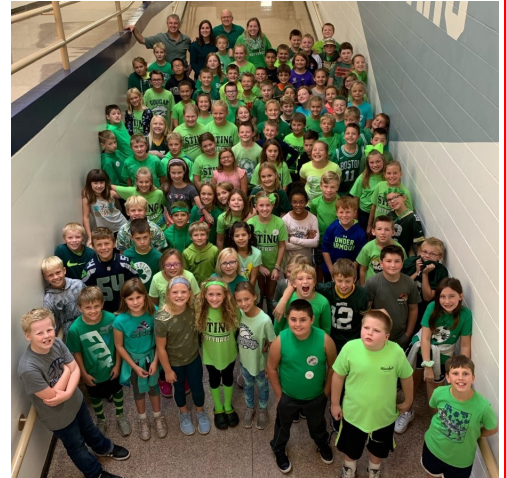
Grade 4 showed their spirit by wearing green on color day