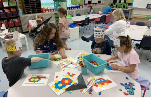
Grade 1 practicing with math blocks