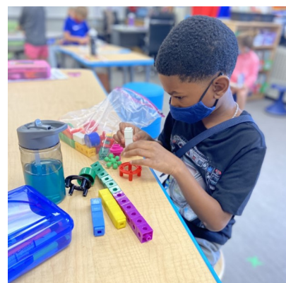
LEGO Learning in the Primary