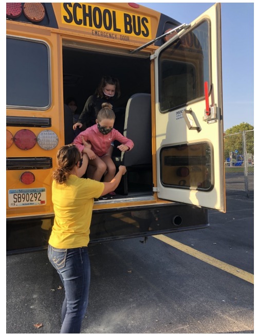
Bus evacuation and training at all three sites keeping our students safe