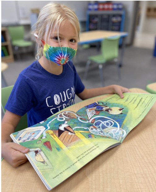
School looks a little different, but the learning is the same!