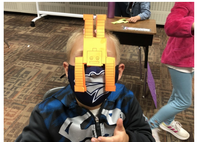
Third grade made "balancing robots" in science

National Honor Society held its long-awaited induction ceremony recently after Covid 19 postponed the spring service. NHS students are chosen for their qualities of leadership, scholarship, service, and character. Congratulations to these outstanding students!