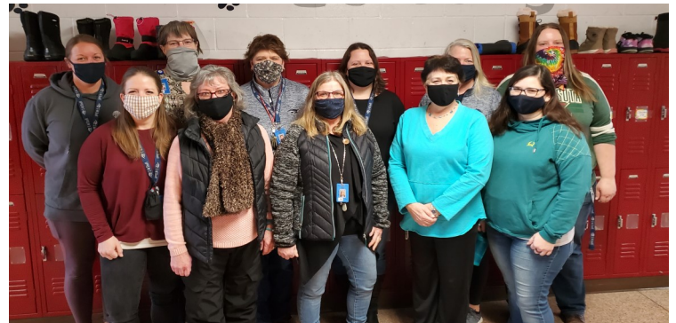
Middle/High School Paras: