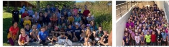
AMERICAN EDUCATION WEEK 2021

Winter Break is December 23rd 2021—January 2, 2022. School resumes January 3, 2022.