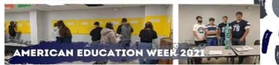
AMERICAN EDUCATION WEEK 2021

Those who TEACH change the WORLD OVER and over again.